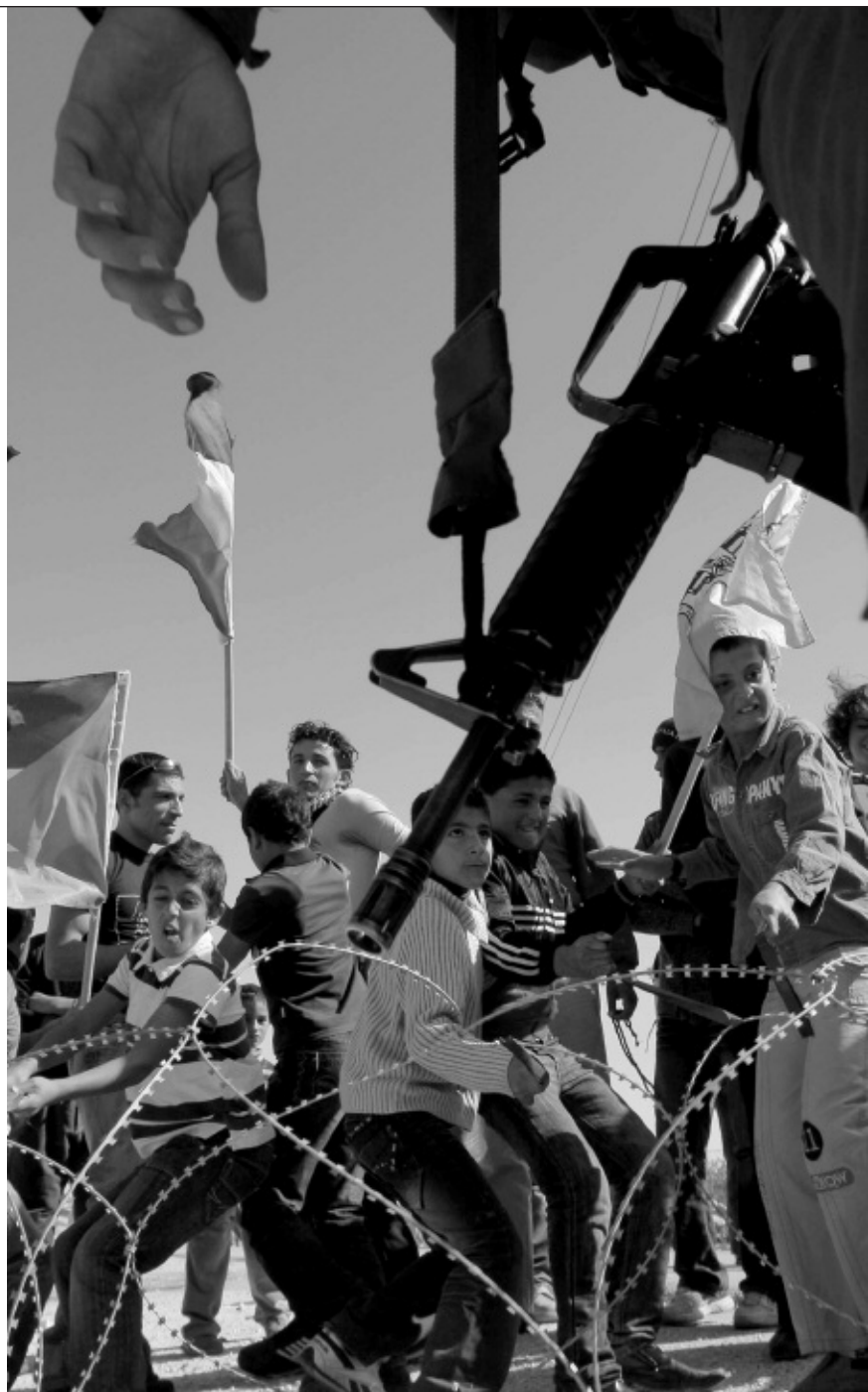
All four participants in this roundtable oppose Israel's Occupation (evoked by this 2009 photo of an Israeli soldier's weapon in front of Palestinians protesting Israel's separation wall). But the participants have different visions about the most viable route toward bringing it to an end.

I don't think that attacking Israel by boycotting, divesting, engaging in protests, preventing its ambassador from speaking, preventing academics from going places, and not buying