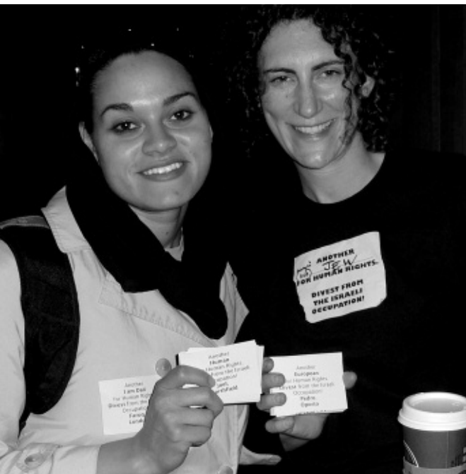
UC Berkeley's student government debated whether to divest from companies profiting from Israel's Occupation of the Palestinian territories this spring. Above, Jewish and Muslim members of the university's Students for Justice in Palestine hold nametags in support of divestment (recreated below for clarity). The motion, which gained support from Noam Chomsky and Desmond Tutu, was passed but vetoed.